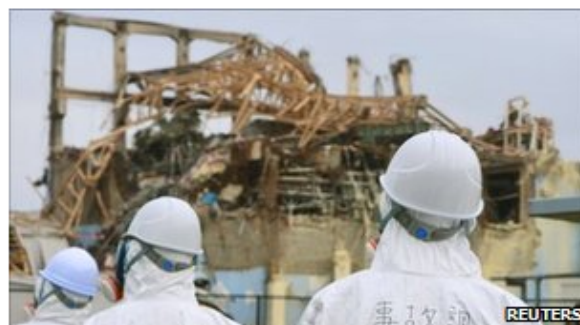
Officials are not yet sure if the readings pose a problem.

There has been no increase in temperature or pressure, but the discovery may indicate a problem with the reactor.